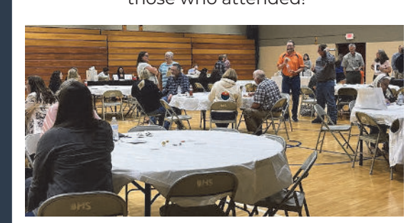
Thank you to everyone who attended Business After Hours! The event was hosted by the Lyon & Murray County CEO Program.