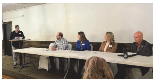
October: Building Inclusive Workplaces