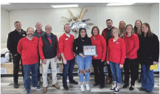
Ez's Lounge First Dollar Award

1001 Lake Yankton, Balaton, MN 56115 507-734-4653 | BalatonBayGolf.com