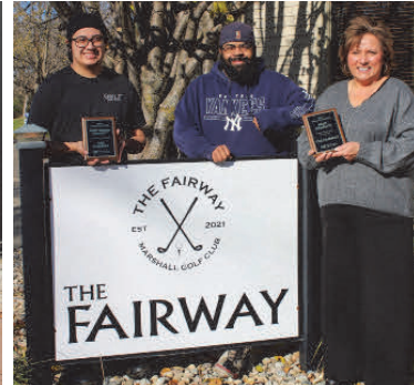
The Fairway Best Product:

Peanut Butter Toffee Bar Sundae Most Unique Product: Smoked Gouda Fondue