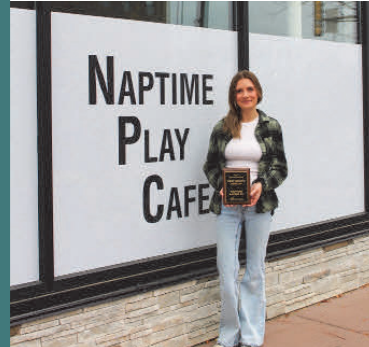
Naptime Baking Co. Best Booth Display