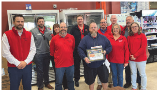
Balaton One Stop First Dollar Award

Progress Award for new parent name for trū companies! 330 3rd Street, Balaton, MN 56115 844-220-7574 | trushrimppcompany.com