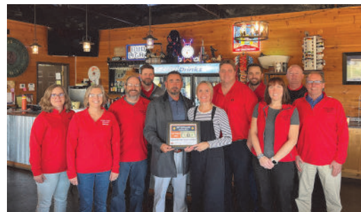
Balaton Bay Golf Course LLC First Dollar Award

451 East Highway 14, Balaton, MN 507-734-5877 | Find Us on Facebook!