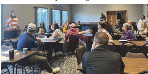
October: Let's Connect