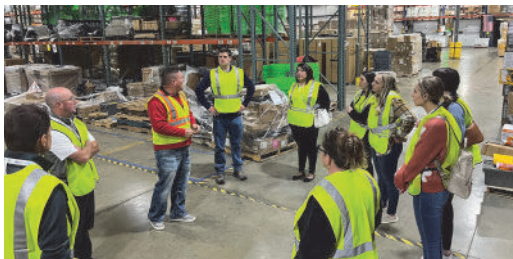
October: Marshall Leadership Academy Manufacturing Day