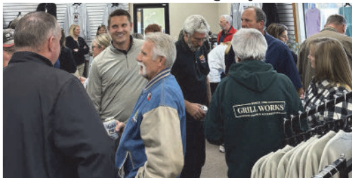
October: Business After Hours Hosted by AP Design & Send It