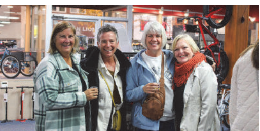
October: Moonlight Madness Marshall Downtown Business Association Event!