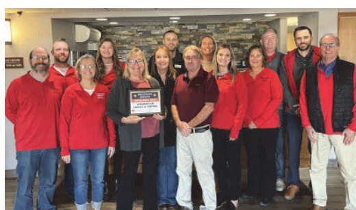
AmericInn Lodging & Suites Progress Award for Building Improvements!

1217 East College Drive, Suite 3, Marshall, MN 507-476-1727 | EzsLounge.glossgenius.com