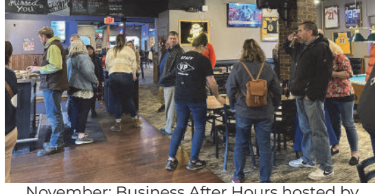
November: Business After Hours hosted by Intentional Action LLC + Extra Innings!