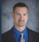
Eric Eben Hoffman & Brobst PLLP 6 YEARS / 2 TERMS