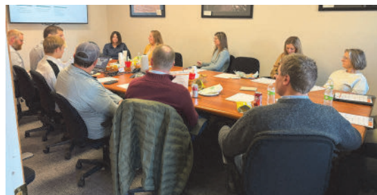
November: Chamber 101