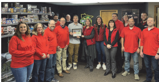
The Card Farmers MN First Dollar Award 109 South 5th Street, Marshall, MN 507-591-2586 | Find Us on Facebook!