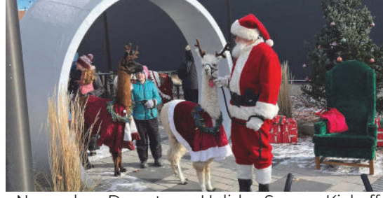
November: Downtown Holiday Season Kickoff [MDBA] Event + Small Business Saturday