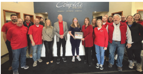
Complete Health Center First Dollar Award 111 Jewett Street, Marshall, MN 507-532-4355 | MyCompleteHealth.net