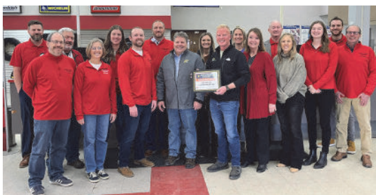
Ag Plus Cooperative Progress Award for Renovations! 1100 East Main Street, Marshall, MN 507-532-9686 | AgPlusCoop.com