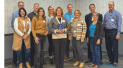
Non-Profit of the Year Pride in the Tiger Foundation Marshall Public Schools