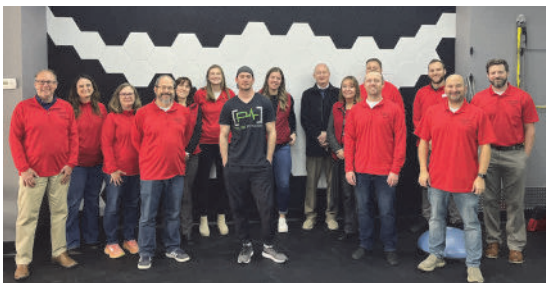
Pulse Fitness First Dollar Award 208 West Main Street, Marshall, MN 507-401-7277 | Find Us on Facebook!