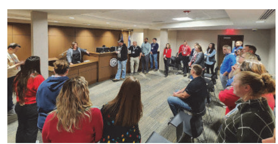
December Marshall Leadership Academy "Public Policy Day"