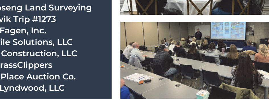
January Marshall Leadership Academy "Community Safety Day"