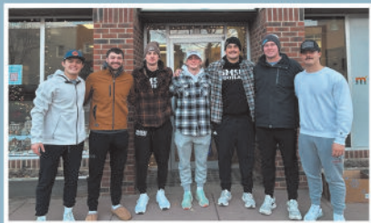
Downtown Christmas Lights are Up! Thank you to members of the SMSU Football Team for putting up the Christmas Lights Downtown Marshall!