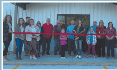
2Arrows Apparel LLC Ribbon Cutting Ceremony 507-430-3161 2arrowsapparel.com