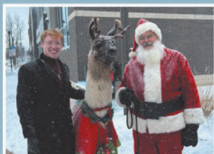
Holiday Season Kickoff A Downtown event featuring Santa Claus & llamas!