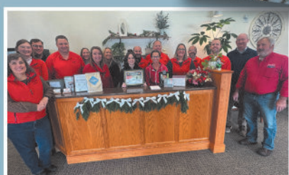
Barberr Health & Spine First Dollar Award 507-532-3273 barberrhealth.com