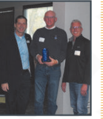
Business of the Year Henle Printing