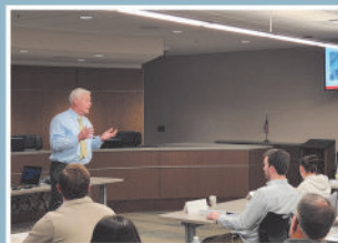
Marshall Leadership Academy Public Policy Day at the Lyon County Government Center