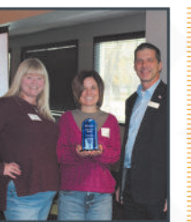
Hospitality Award Main Stay Cafe