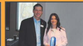
Best Booth Display Naptime Play Cafe & Bakery