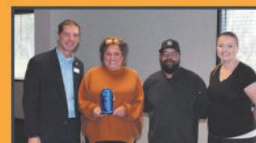
Most Unique Product The Fairway