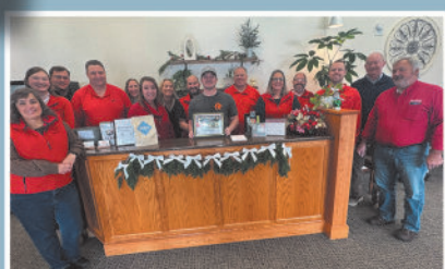
PJ's Electric First Dollar Award 507-829-9294 Find Us on Facebook!