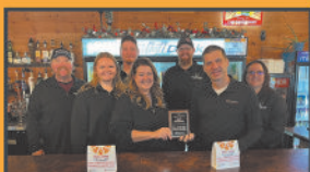
Best Product Balaton Bay Golf Course