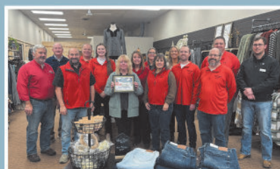
RLee's Emporium First Dollar Award 716-640-6977 rleesemporium.com