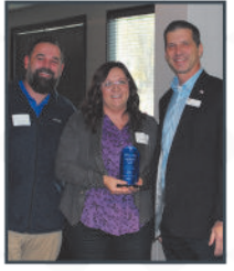
Non-Profit of the Year Hope Harbor