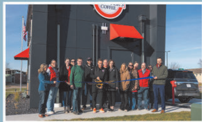
Scooter's Coffee Ribbon Cutting Ceremony 507-476-1760 scooterscoffee.com