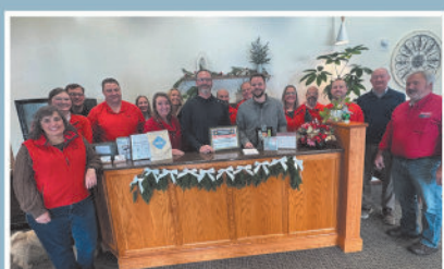
Boerboom Insurance Agency Progress Award for Moving Locations! 507-532-8999 boerboominsurance.com