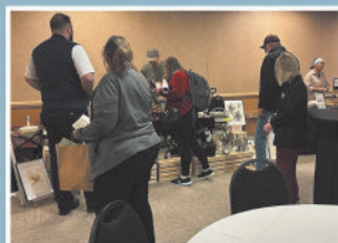
Business During Hours Hosted by SMSU Center of Innovation & Entrepreneurship