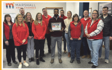
ETM Softwares First Dollar Award 405-760-5488 EnterpriseTechManagement.com