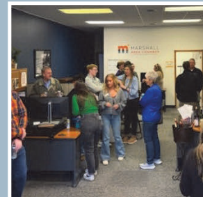
Business After Hours Hosted by the Marshall Area Chamber