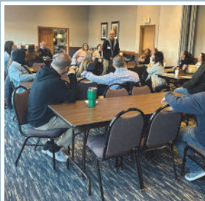
Let's Connect A Chamber member favorite event!