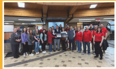
Old National Bank Progress Award for a new name! 507-537-0222 OldNational.com