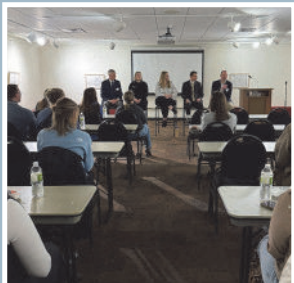
Young Professionals SMSU Growth & Success