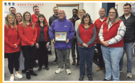
Eagle Run Taxi First Dollar Award 507-591-3129 Located in Marshall