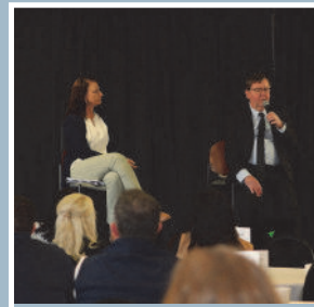
State of the City Thank you to all who attended!