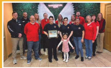
La Michoacana Elite First Dollar Award 507-401-3162 Find Us on Facebook & Instagram!