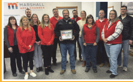
MnKota Irrigation First Dollar Award 507-706-2515 Located in Marshall