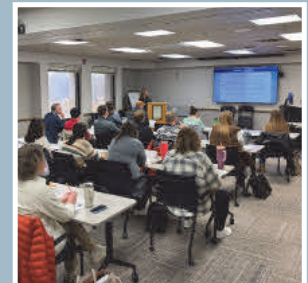
Marshall Leadership Academy Healthcare Day