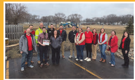
True Light Christian School Progress Award for new playground equipment! 507-532-2762 TrueLightChristianSchool.com