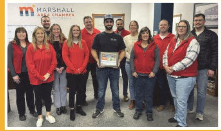
True Blue Window Cleaning First Dollar Award 507-476-7373 TrueBlueWC.com