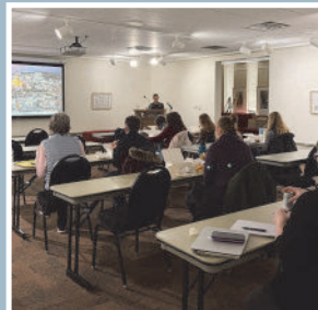
Lunch & Learn AI Video Tools + Small Bus. Development Center