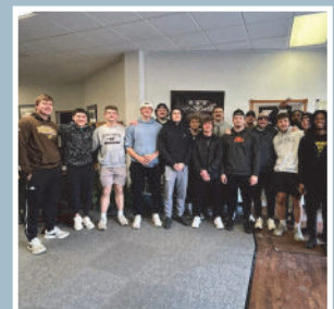
SMSU Football Thank you for taking down the Christmas lights!

317 W MAIN ST • SUITE 2 • MARSHALL, MN 56258 | 507-532-4484 | MARSHALLMN.ORG | MarshallAreaChamber MarshallAreaChamber ChamberMarshall