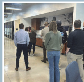
Young Professionals SWWC Service Cooperatives