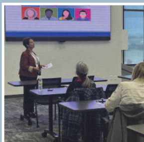
Women's Connect "Generations in the Workplace"

Business After Hours The Culligan Marshall Radio Home Show was the host for Business After Hours in March at the Red Baron Arena.