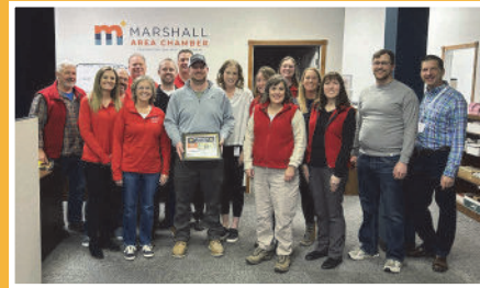
Southwest Pro Painting First Dollar Award 320-815-8216