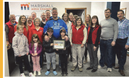
MN Window Guy LLC First Dollar Award 507-530-7623