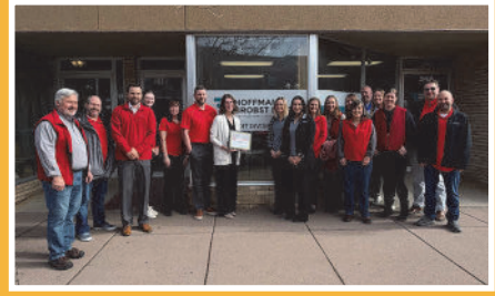
Hoffman & Brobst PLLP Progress Award for a satellite office! 507-537-0696