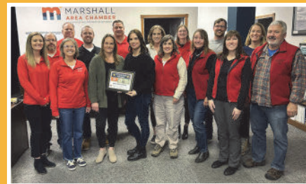
Once Upon a Picnic Events & Rentals First Dollar Award Located in Marshall