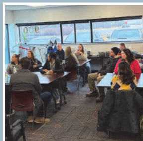
Marshall Leadership Academy Education Day