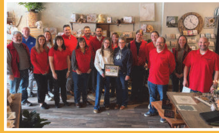
Third Street Floral First Dollar Award 507-476-0714