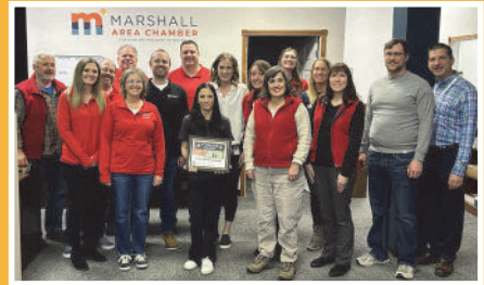
Clean Sweep Cleaning LLC First Dollar Award 507-591-3411