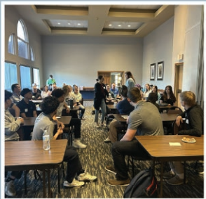
Let's Connect Thank you to all who joined us!