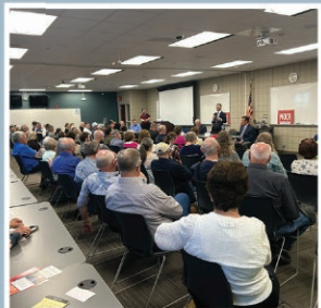
Republican 15 A Forum - Hosted at the MERIT Center