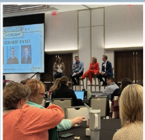
MACE Conference 2 staff members attended in April!