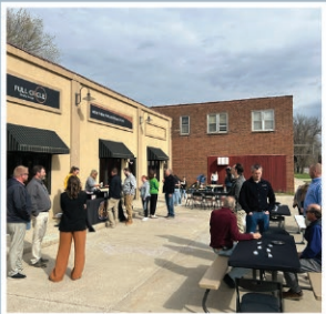
Business After Hours Hosted by Full Circle Realty Group