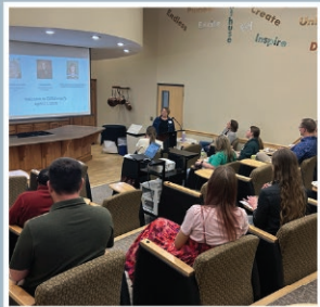
Young Professionals "Behind the Scenes at Schwan's"