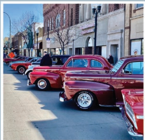
Downtown Marshall + Shades of the Past Roll-In