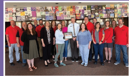
Southwest Minnesota State University Entertainment and Theatre Arts Progress Award for Name Change 507-537-7103 SMSU.edu