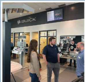
Business After Hours Hosted by Kruse Motors