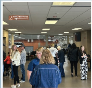
Business After Hours Hosted by Lyon & Murray County CEO