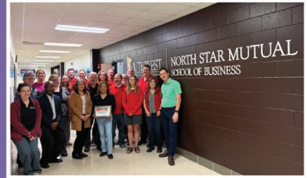
Southwest Minnesota State University North Star School of Business Progress Award for Name Change 507-537-6260 SMSU.edu