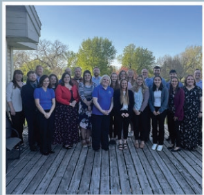
Marshall Leadership Academy (MLA) Graduation Day!