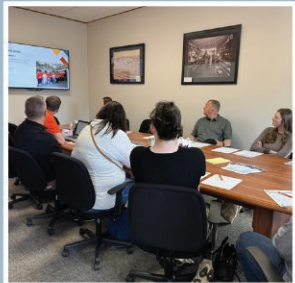
Chamber 101 Thank you to everyone who made it!